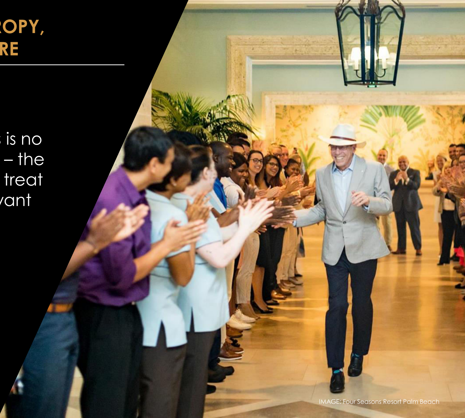
IMAGE: Four Seasons Resort Palm Beach