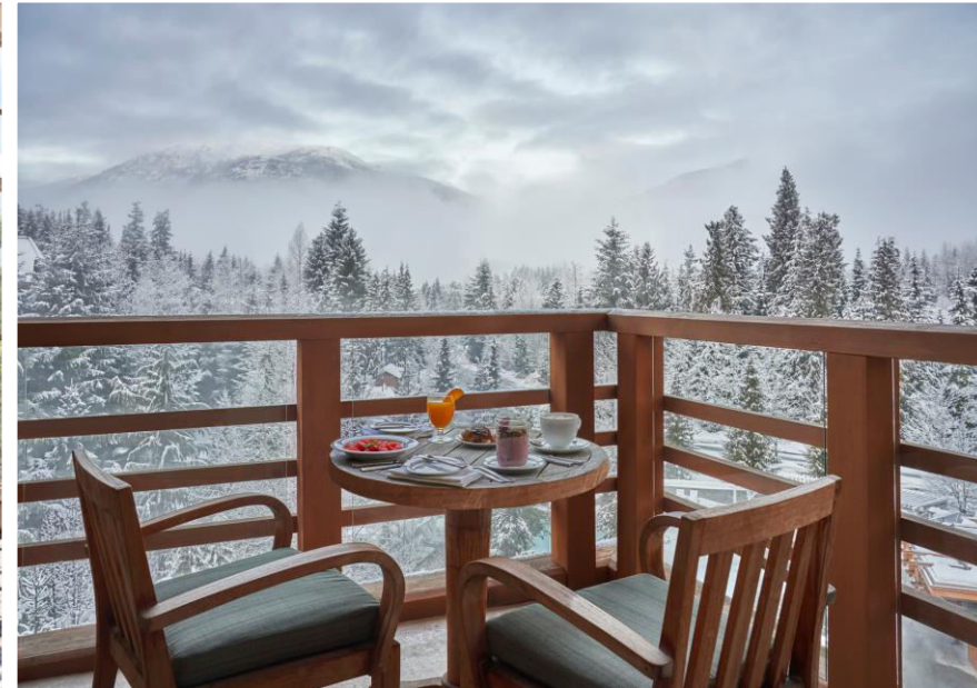
FOUR SEASONS RESORT AND RESIDENCES WHISTLER