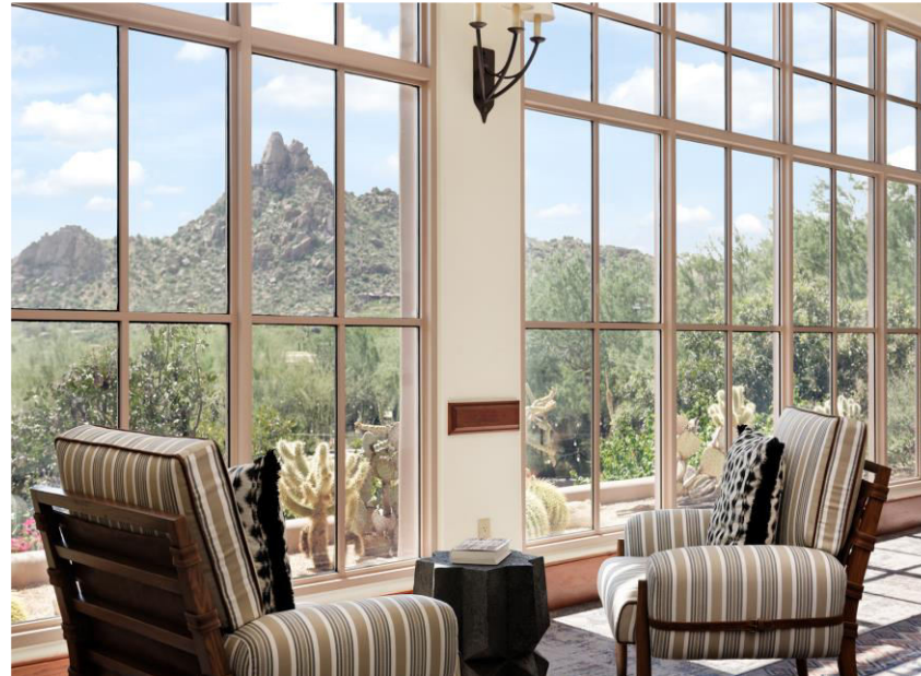
FOUR SEASONS RESORT SCOTTSDALE AT TROON NORTH