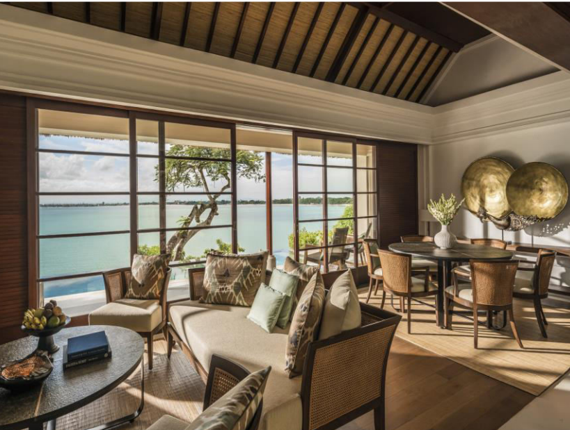
FOUR SEASONS RESORT BALI AT JIMBARAN BAY