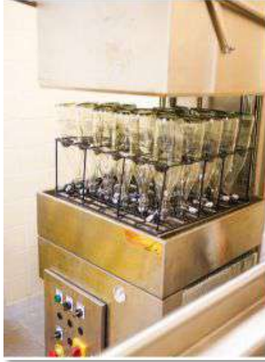
WATER BOTTLING PLANT