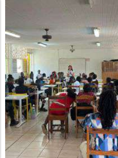
EDUCATION & COMMUNICATIONS