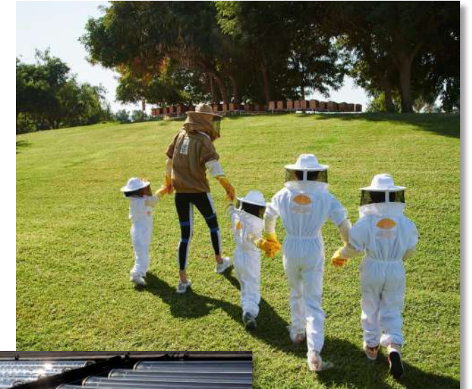
Emirates Palace Mandarin Oriental, Abu Dhabi partnered with a local beekeeper