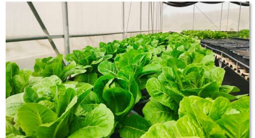
Sending wet waste as fertilisers to an organic farm creating a circular loop, Mandarin Oriental, Bangkok