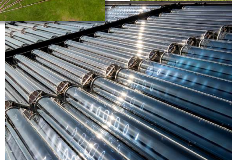
Mandarin Oriental Hyde Park, London partnered with Naked Energy