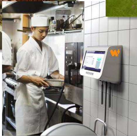
The Group partnered with Winnow