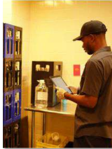
DATA COLLECTION & MANAGEMENT