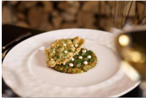
Zero-waste luncheon menu in Dinner by Heston Blumenthal, Mandarin Oriental Hyde Park, London