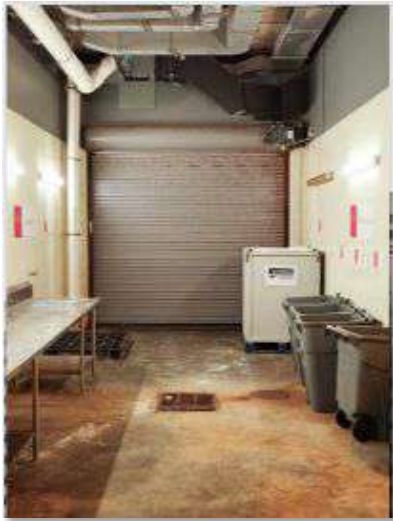
WASTE MANAGEMENT FACILITY