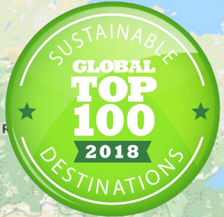
2018 Sustainable Destinations Top 100