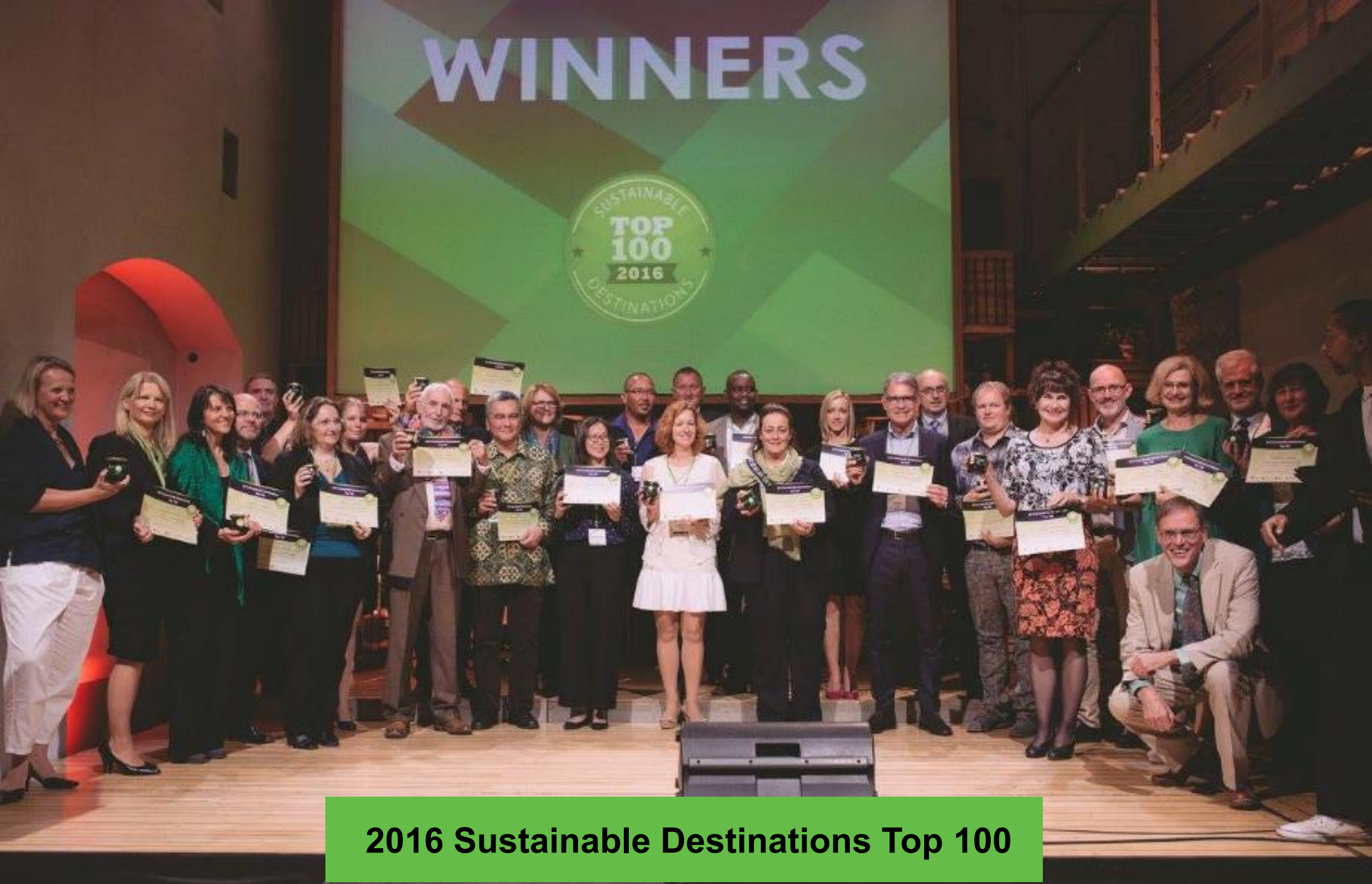
2016 Sustainable Destinations Top 100