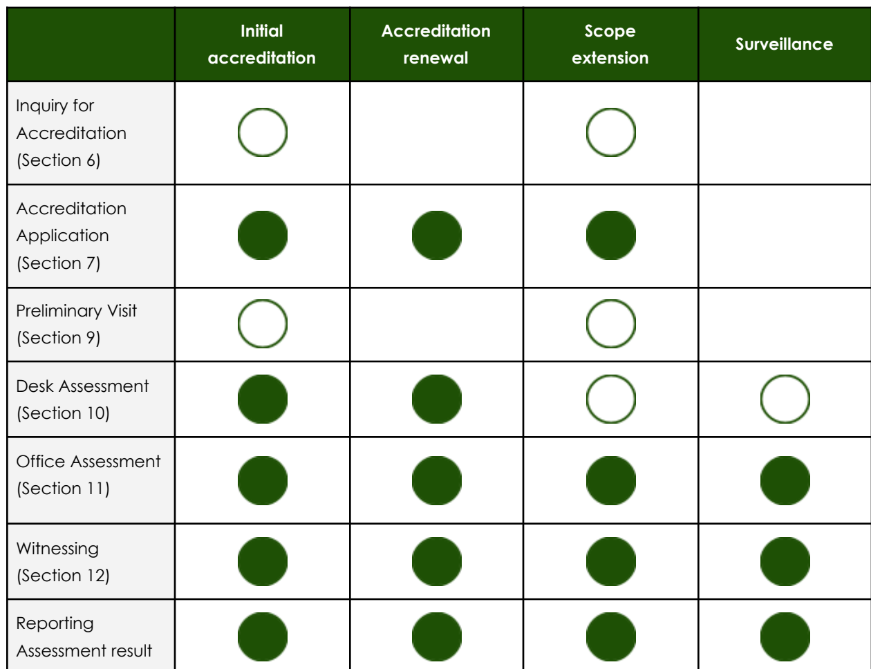
Table 2. Specific procedures for each accreditation step

5.5. Opening and closing meetings may be conducted remotely, if necessary with prior agreement from both parties.