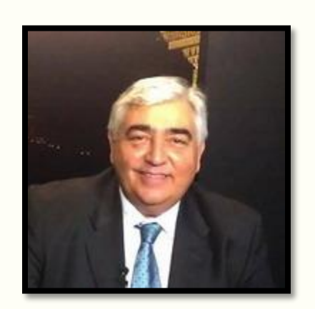
Gerasimos Damoulakis Mayor of Milos Island, President of Tourism Board of Central Union of Greek Municipalities